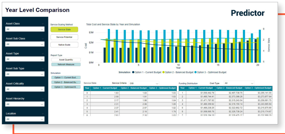
Figure 2. Year-Level Comparison