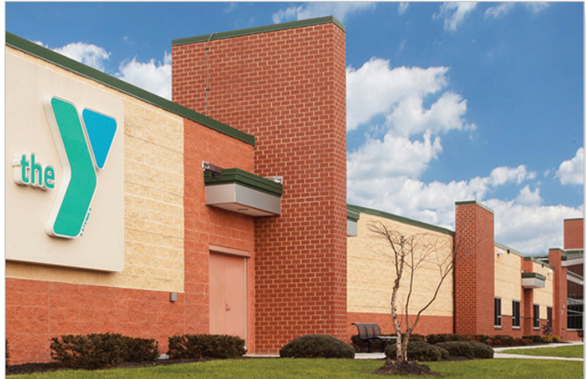
One of the YMCA of Delaware locations