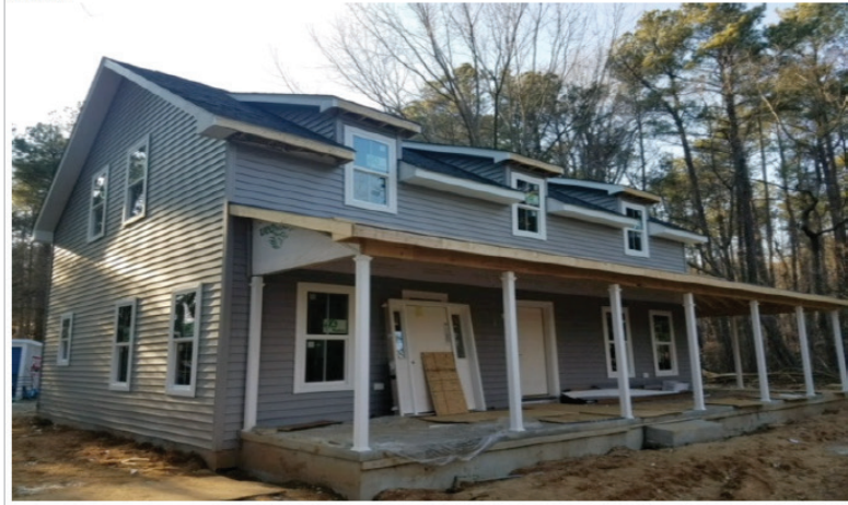
A set of project images from the annual report